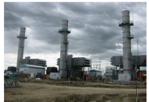
Crossfield Energy Centre's Three Gas Turbine Units