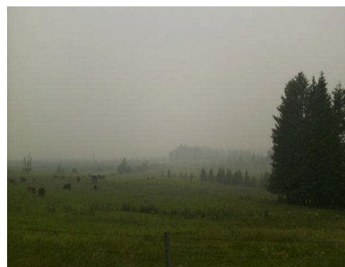
Forest Fire Smoke near Bowden

The graph below illustrates the PM 2.5 levels recorded at the Red Deer Riverside Air Quality monitoring Station during August 2010. One can see the PM 2.5 Concentrations on August 19 th and 20 th were so high they exceeded the monitor's full scale operating range of 450 ug/m 3 !