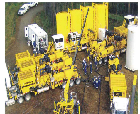
Century Hydraulic Fracturing work-over at a well site in Northern Alberta

Use of the technology has many advantages for both the company and area residents. Potential benefits include enhanced recovery of the resource, reduced number of well leases, and the need for fewer access roads. In addition, the overall time that drilling and servicing equipment and trucks spend in a given area can be reduced as companies are able to more effectively develop hydrocarbon reservoirs through fewer wells.