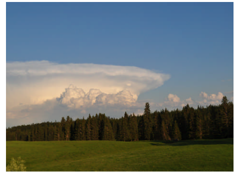
Dallas Rosevear- Clouds over pasture