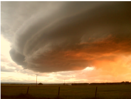
Leanne Kerik- Mesocyclone Cloud