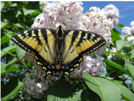
Sharon Blain- Monarch Butterfly