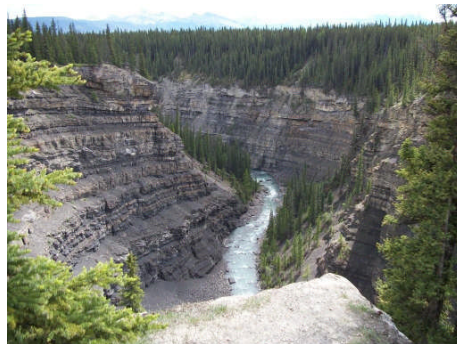
Sheree DeCoteau- Crescent Falls