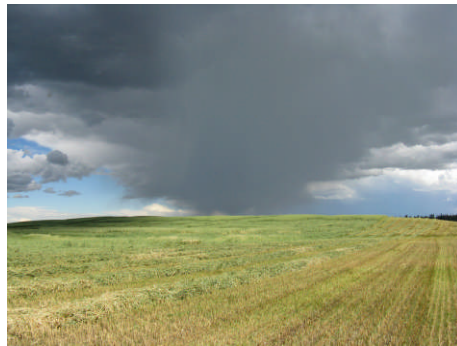
Sharon Blain- Storm Cloud over silage Field