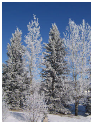
Jared Harder- Frost on Trees